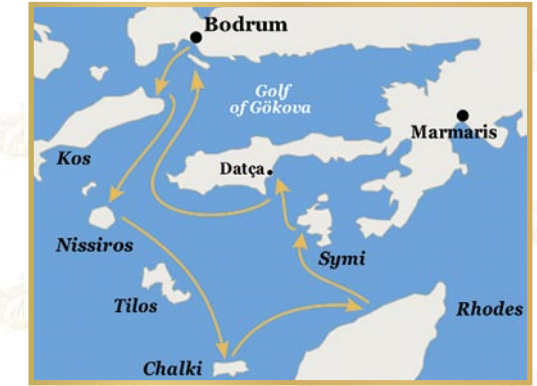
BODRUM - KOS - NİSİROS - TİLOS - RODOS - SYMİ - BODRUM